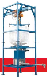
BULK BAG UNLOADERS

Customizable, adjustable, and modular units to fit your process