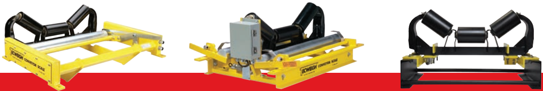
CONVEYOR BELT SCALES

Easy to use, dependable and accurate scales in single to four idler configurations